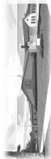
Capri Christian Church

Preaching the Gospel of Jesus from the Isles of Capri